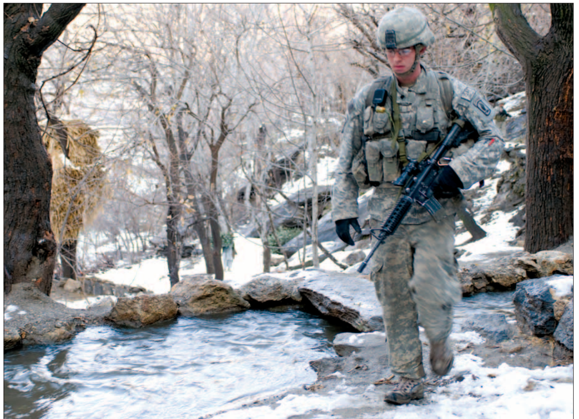
A paratrooper of 2nd Platoon, Able Company, 2nd Battalion, 503rd Infantry Regiment (Airborne), walks next to a creek during a patrol to Omar in Kunar Province Afghanistan.

Able Co. works side-by-side with the Afghan National Police and Afghan National Army to help bring security and development to the area.