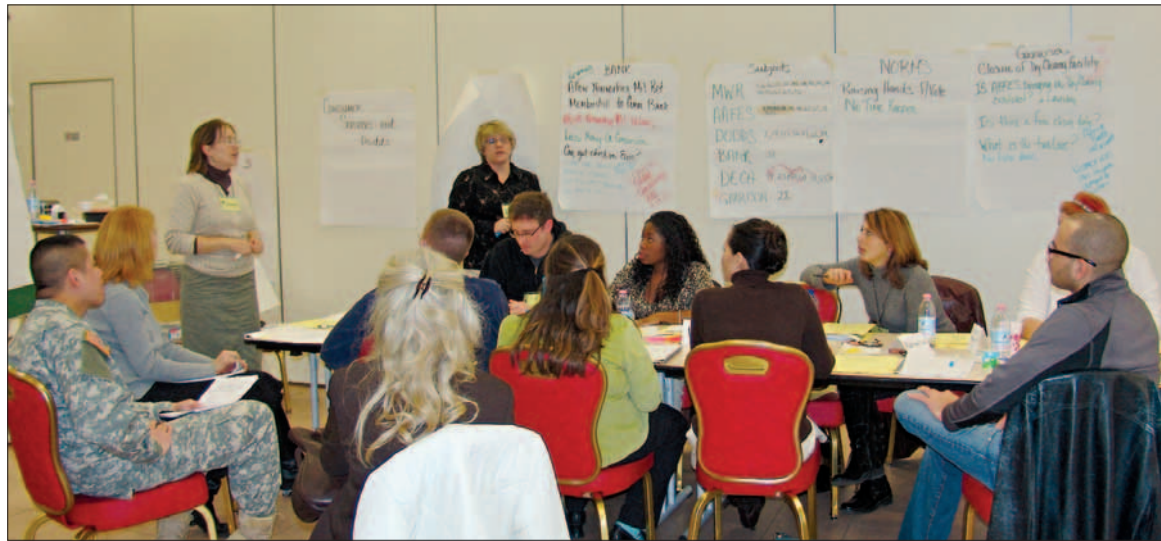
AFAP Delegates worked for two days with subject matter experts to identify issues that have an impact on the quality of life during Camp Darby's AFAP conference.