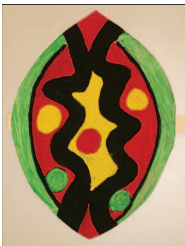
Livorno fourth grade students discussed the designs used by the Masai tribes in Kenya and the Zulu tribes in southern Africa.