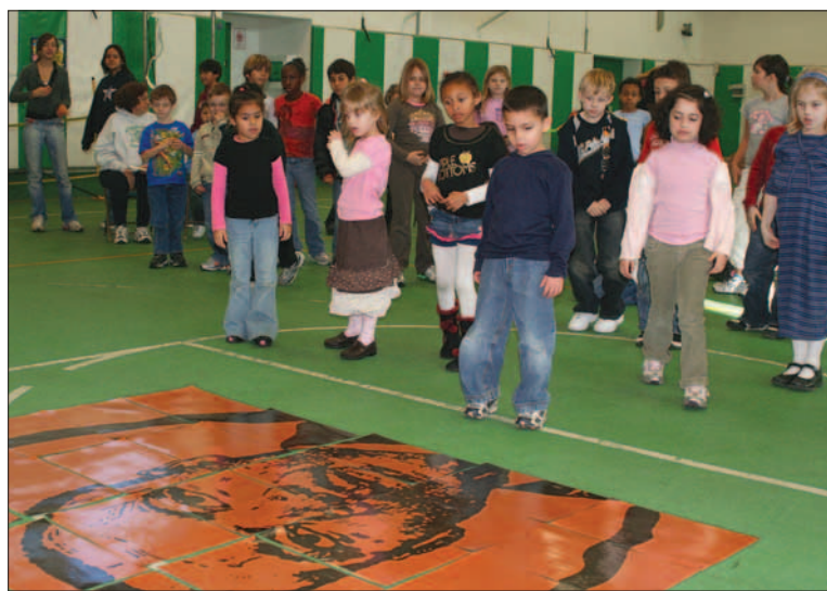
Livorno Unit School elementary students take a closer look at a puzzle to identify who it is. The middle school students read a speech by Martin Luther King Jr. during a school assembly and after each had read their own part, they placed the backside of their speech down to form an image of Rev. King.